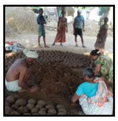
3. Mulch and crop residues